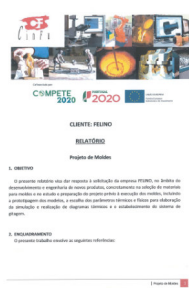
Technical assistance for development and engineering of new products