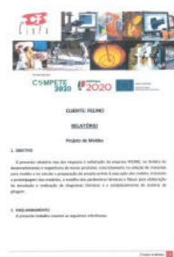
Technical assistance for development and engineering of new products