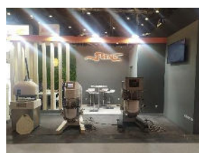
Exhibition Intersicop, 2022, Spain