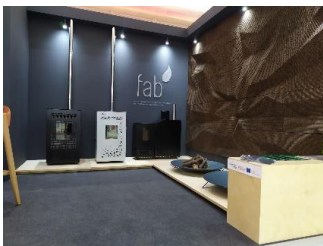
Exhibition ExpoBiomassa, 2021, Spain