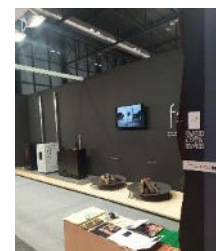
Exhibition C&R, 2021, Spain