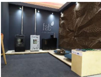
Exhibition ExpoBiomassa, 2021, Spain