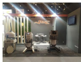
Exhibition Intersicop, 2022, Spain