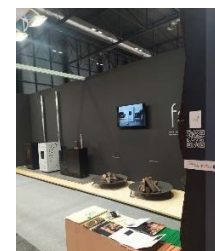
Exhibition C&R, 2021, Spain